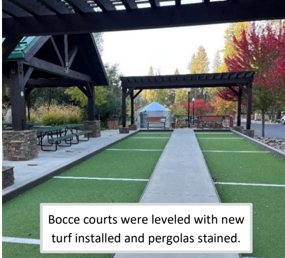
Bocce courts were leveled with new turf installed and pergolas stained.