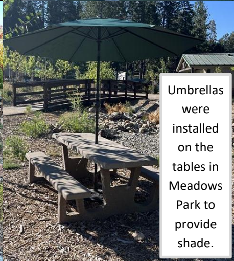
Umbrellas were installed on the tables in Meadows Park to provide shade.