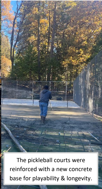
The pickleball courts were reinforced with a new concrete base for playability & longevity.