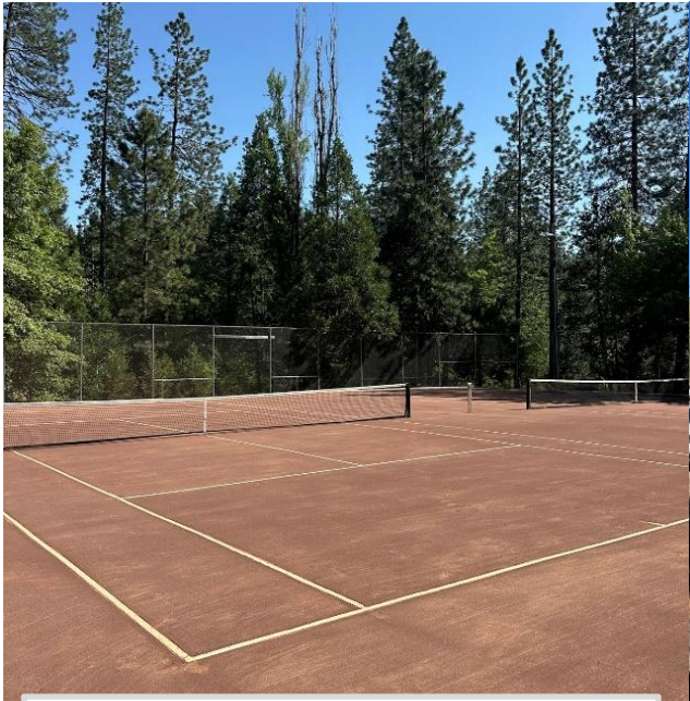
The tennis courts were upgraded to a hybrid clay surface that is safer and better to play on at higher elevations. It also extends the life of the courts.