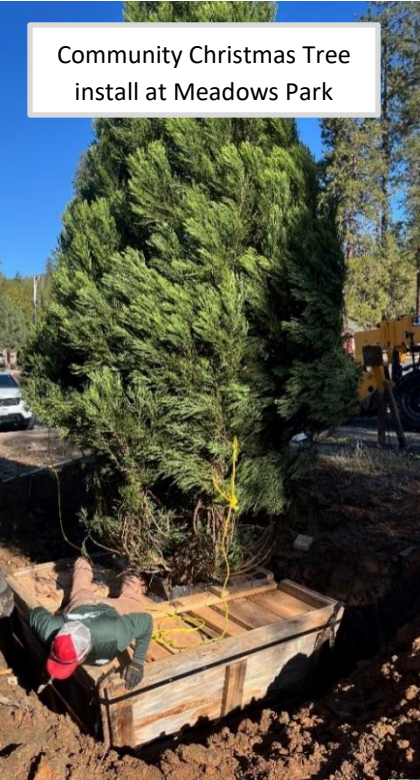
Community Christmas Tree install at Meadows Park