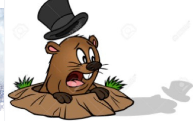
Oh yeah, I see my shadow!