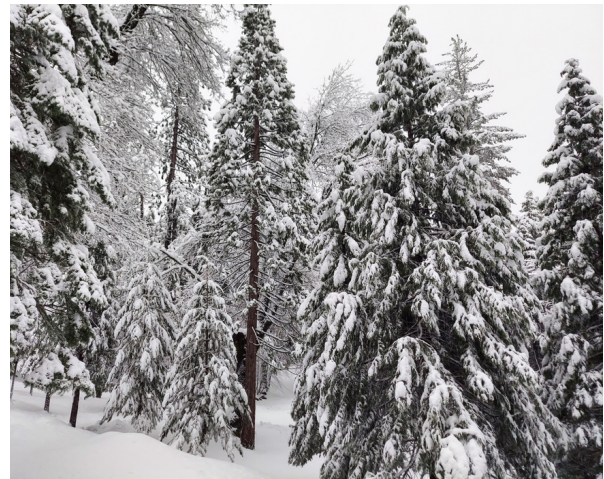
Looking out my window as I write this article

it have been great to be on a net and hear what was happening during the white out? Share what is happening around you? The training has been reschedule for March 25, and I hope you plan to attend. We will show you how to keep in touch.