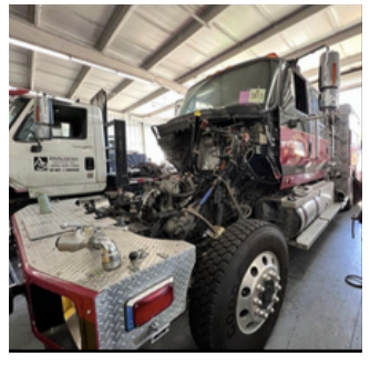
Repair work has started on E-723

The old 720 command vehicle has been sold to a volunteer department in Illinois.