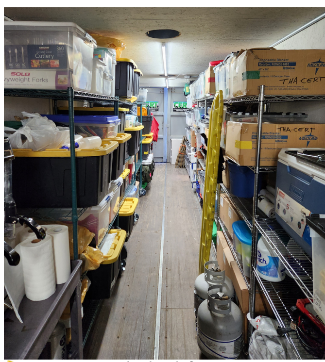
Organized and ready for inventory

There were 5 of us that first day. Turns out, we have a lot of stuff! A second crew spent a few days organizing things and throwing out expired items and garbage. Inventory will happen soon and we'll use that as an opportunity to purge more of the things we have that are no longer used or necessary. We have a little bit more to move out of the THCSD office we were using, which will be done by the end of November, and then we are finished with the moving portion of this project.