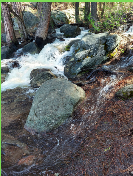
Water Falls at Pinecrest Lake