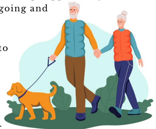
Keep Active Walking with your dog

2) Be aware of your surroundings at all times. It is easy to get distracted and not realize that you are walking into a hazard. Twigs and acorns on the ground can be slippery and are a fall hazard. A walking stick can be stylish and useful.