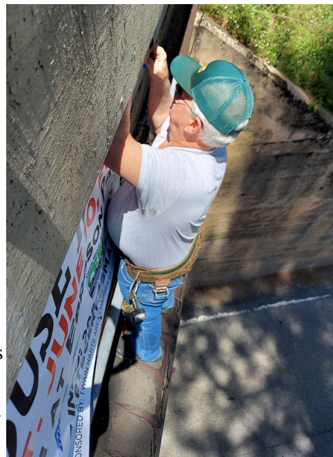
Banner hanging on the overpass in Twain Harte