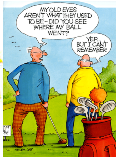
Keep Active Golf with a friend