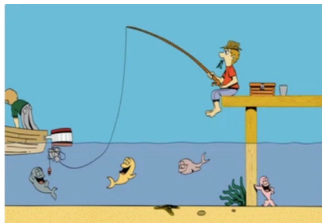
Keep Active Fishing