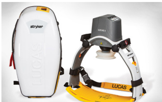
The portable LUCAS device

This device enables one person to more effectively administer CPR, while also providing artificial respiration, and can maintain compressions even while the patient is being moved from the incident site to an ambulance or helicopter. For someone in cardiac arrest, keeping the blood circulating means greater chances of survival and recovery.