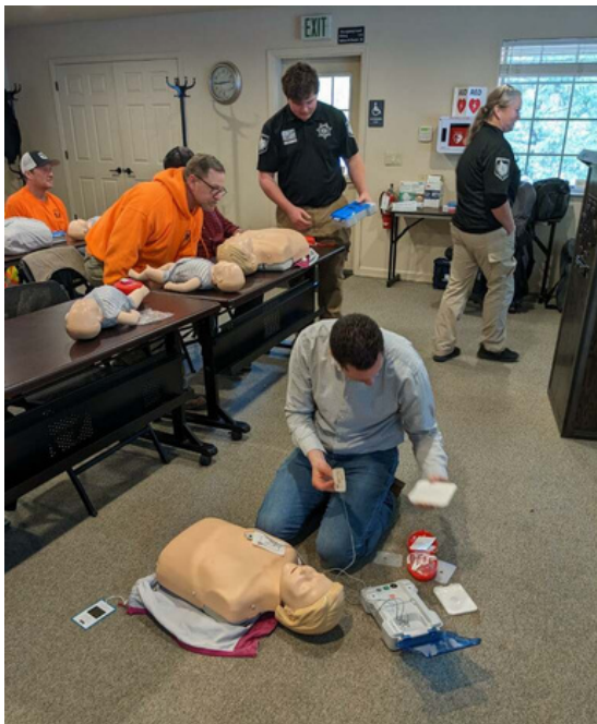
THCSD staff members practice at the February CPR/AED training

On March 6th, the Twain Harte Fire Department completed a year-long community project called the Twain Harte Heart Start. This community project, which was grant funded by the Sonora Area Foundation, intended to strategically place Automatic External Defibrillators (AED) in high foot traffic areas in Twain Harte, which would allow quicker deployment of an AED if someone were in need. This grant also provided each business location where the AEDs were placed free CPR/AED training and state-of-the-art CPR manikins and AED trainers.