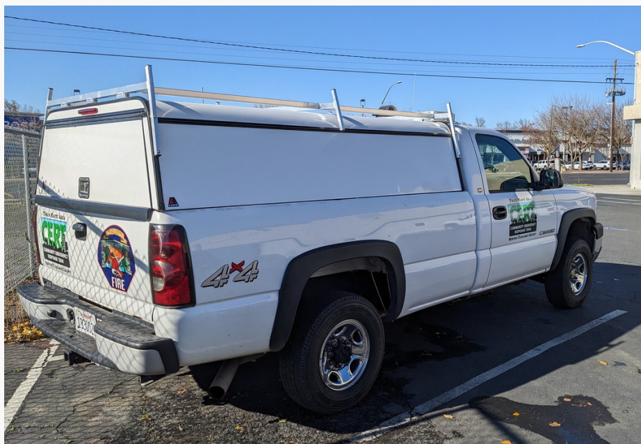
Newly Outfitted UAS Command Vehicle