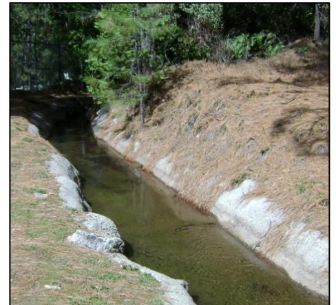
Section 4 Ditch (Twain Harte)

Over the last several years, we have also constructed three grant-funded groundwater wells, which are used regularly to supplement the surface water supply and provide greater water reliability to the community.