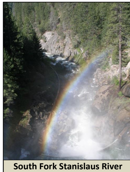
South Fork Stanislaus River

In order to ensure that tap water is safe to drink, the U.S. Environmental Protection Agency (U.S. EPA) and the State Water Resources Control Board (State Board) prescribe regulations that limit the amount of certain contaminants in water provided by public water systems. State Board regulations also establish limits for contaminants in bottled water that must provide the same protection for public health. Drinking water, including bottled water, may reasonably be expected to contain small amounts of some contaminants. The presence of contaminants does not necessarily indicate that water poses a health risk.